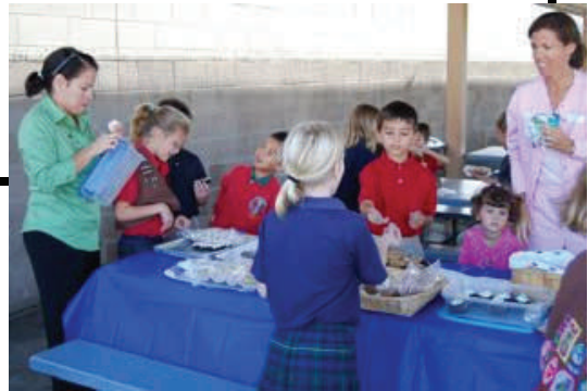
2nd Grade Bake Sale

This focus area is Needy Children in Orange County . This year the Second Grade class had a bake sale and book drive. The books and proceeds of the bake sale went to help a second grade class at School of Our Lady in Santa Ana. School of Our Lady is in a tuition challenged area, so many students are receiving assistance, and no money is available for basic supplies. Our second graders were able to share their blessings with their counterparts at another Catholic school close to ours.